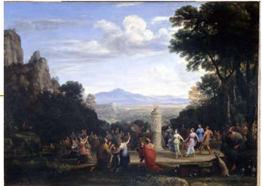
Lorrain Claude, Klanjanje zlatnom teletu, 1660.