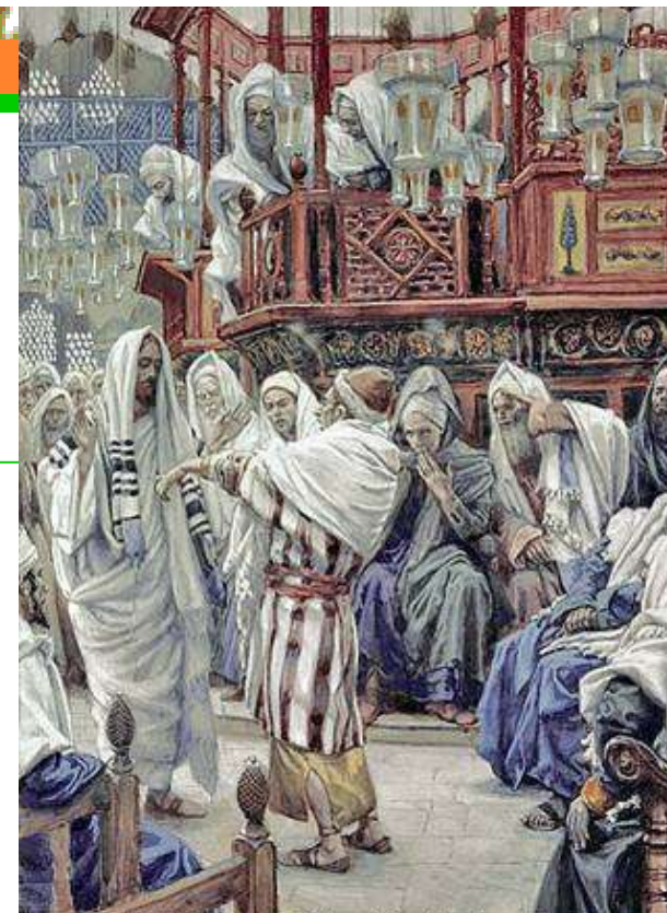
Christ Healing the Withered Hand by James Tissot