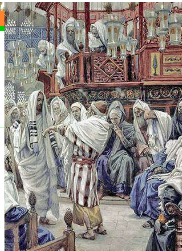
Christ Healing the Withered Hand by James Tissot