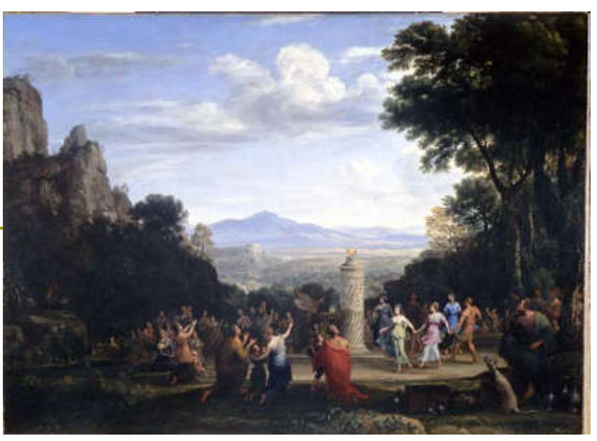
Lorrain Claude, Klanjanje zlatnom teletu, 1660.