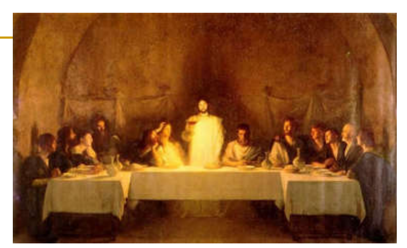
The Last Supper, Pascal-Adolphe-Jean Dagnan-Bouveret, Private collection

"This cup is the new covenant in my blood" (1 Kor 11:25=Lk 22:20)